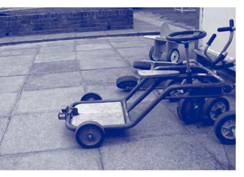
The bikes

researcher sitting on the floor with the computer. The children were placed in charge of the slideshow of photographs so they could decide when to linger on a particular photograph and when to move on. If this technology had not been available, children reviewing an album of their own photographs with a researcher could have given children the same level of control of the exercise.