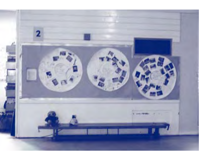
Maps by nursery children on display in the school hall

The maps displayed a range of personal and shared meanings about the nursery and its environment, reinforcing the impressions gained from reviewing the children's photo books. Personal spaces included references to a sibling's classroom and photographs of benches where several of the children waited with their parents before nursery started in the morning. Shared spaces included the toilets, reading corner and the carpet. There was a prevalence of doors and gates marking the different boundaries of the children's world.