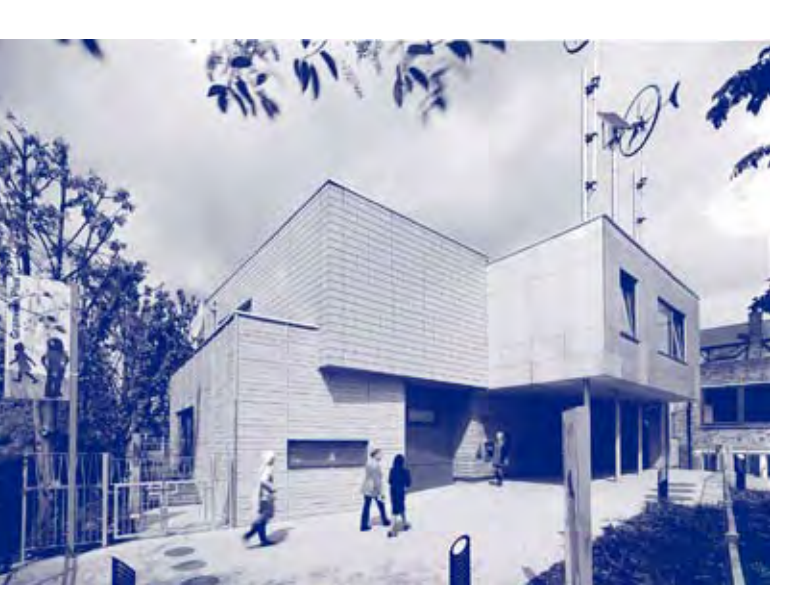
External view of the completed Children's Centre

The second case study in the Living Spaces study was chosen as it presents an example of a review of a recently completed Children's Centre. This centre, in keeping with others in the country combines a refurbishment project with 'new build' elements. The Head of Early Years in the London borough concerned identified the centre as a potential partnership where the practitioners and architects would be interested in a project which centred on listening to young children.