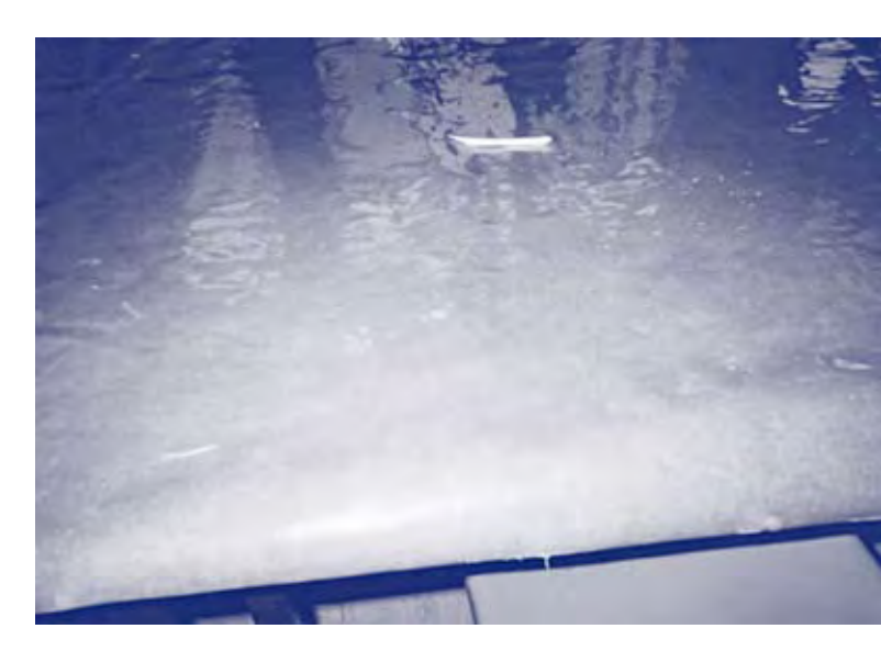
'The water and the boat'

Natalie's photos emphasised activities that took place in such spaces as the sand and water trays. The class pet hamster was a popular choice. Natalie's image of the hamster's cage prompted an interesting conversation about