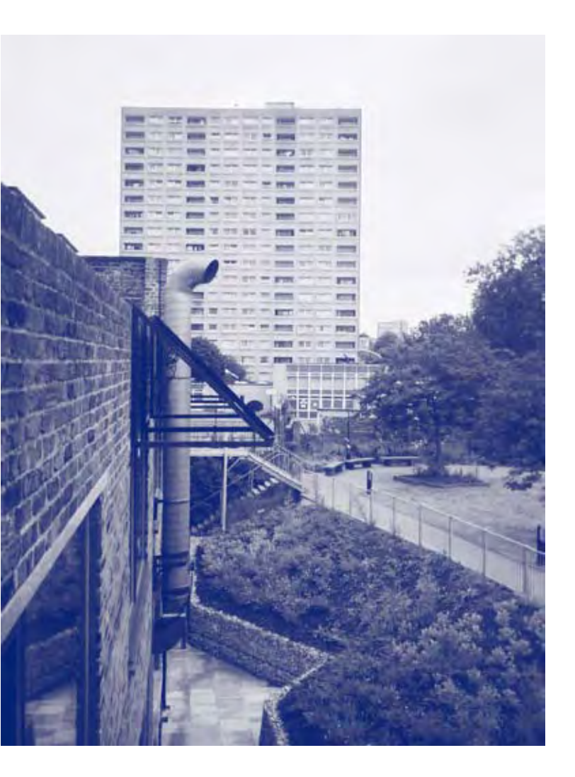
An image from the midwife's map entitled 'we are in the community'