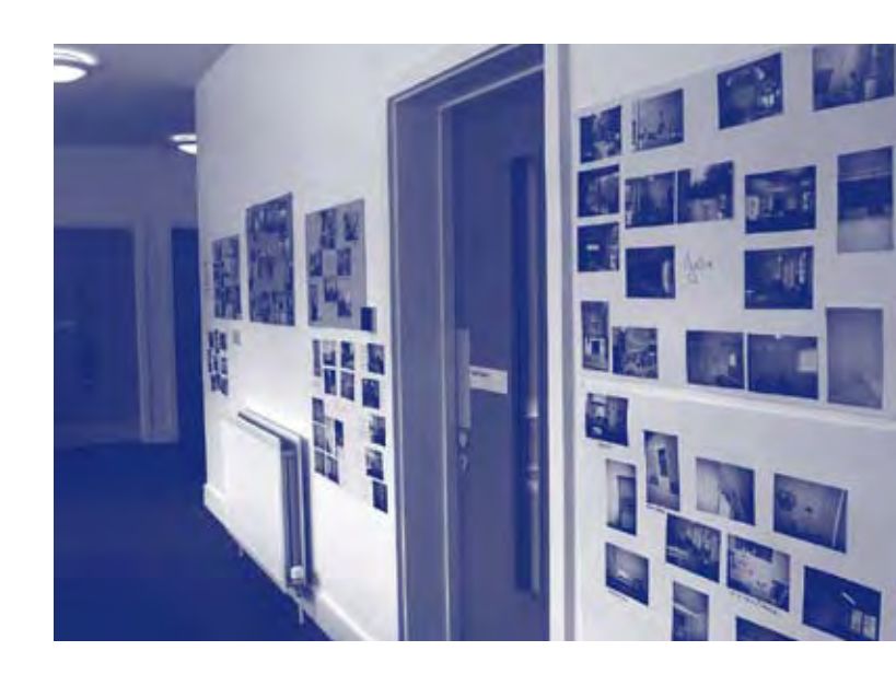
Practitioner maps on display in the new building

There are three critical areas of the DQI: function, build quality and impact.