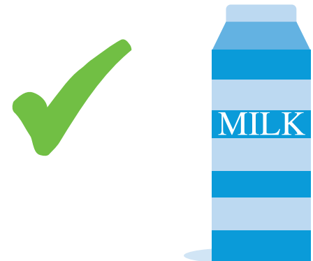
Cow's milk after 1 year