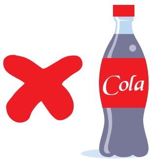
Soft drinks eg. cola