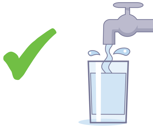
Tap Water after 6 months