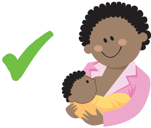
Breast milk or formula