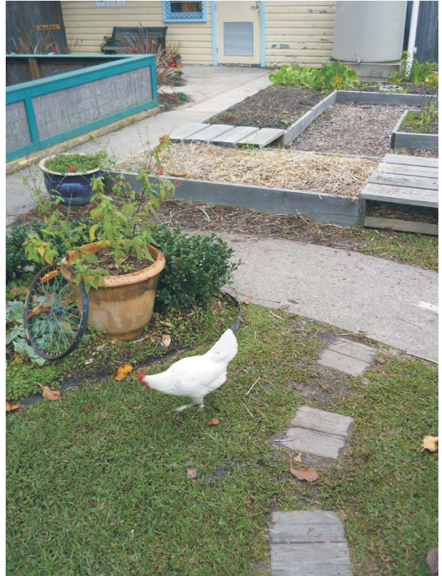
Chooks and vegetable gardens