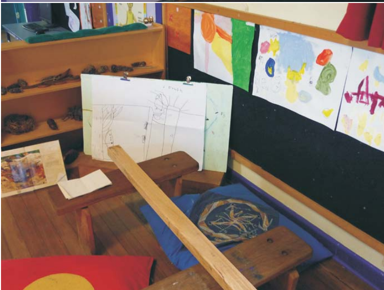
Designing bird feeders