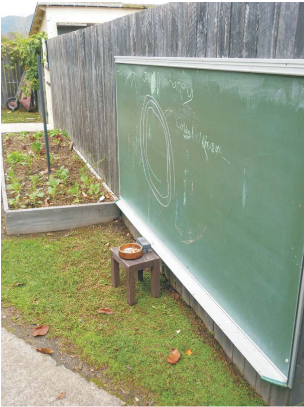
Outdoor chalk boards