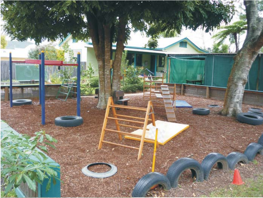
Wooden climbing frames and planks