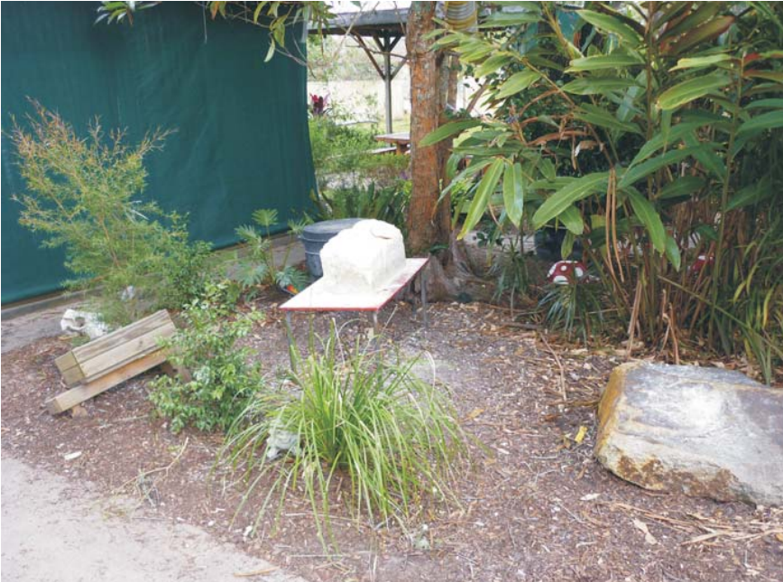
Places to sculpt