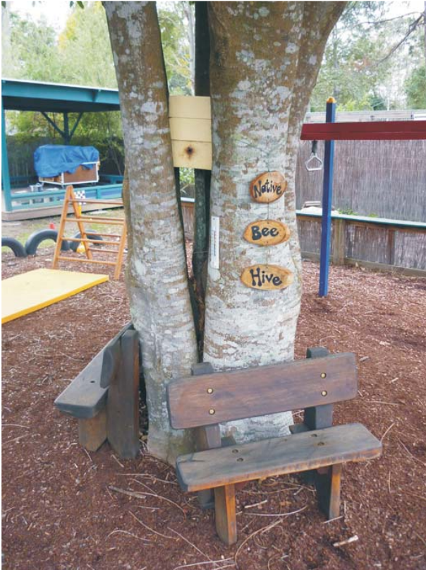
A native Australian bee hive with real bees. They don't have a sting.