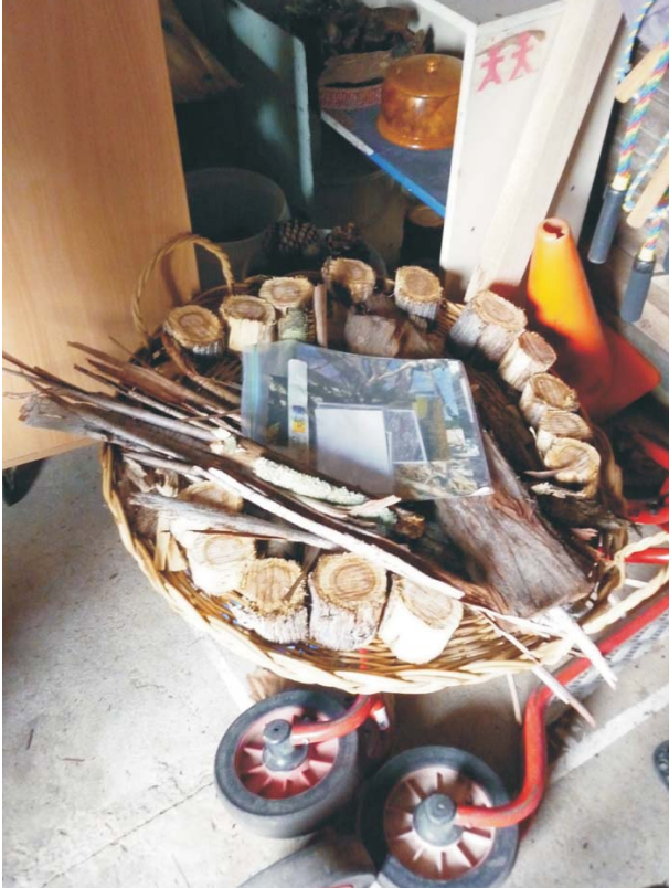
Outdoor equipment. Cut logs