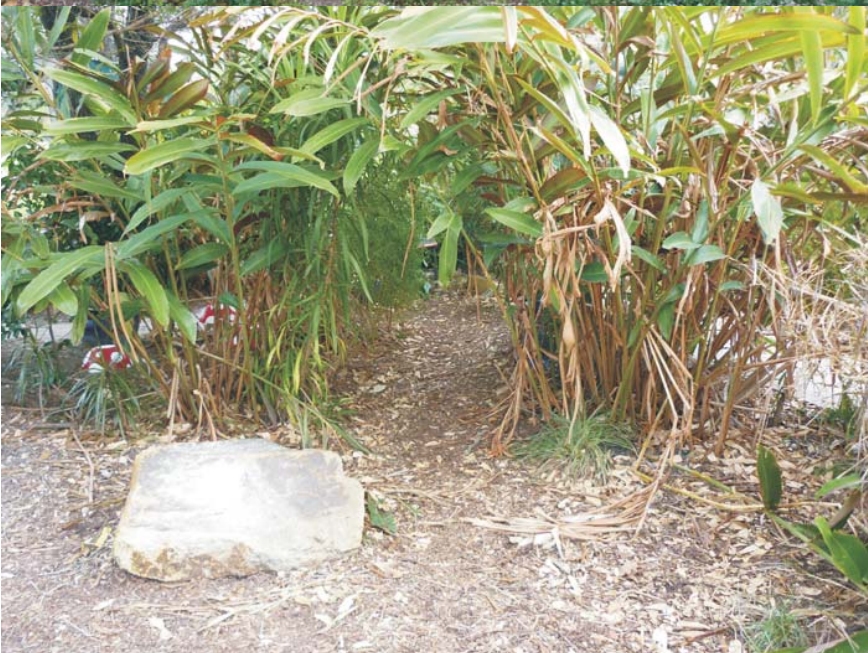
Places to hide