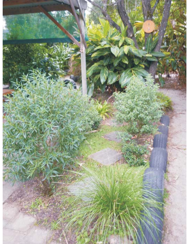
Lush garden areas