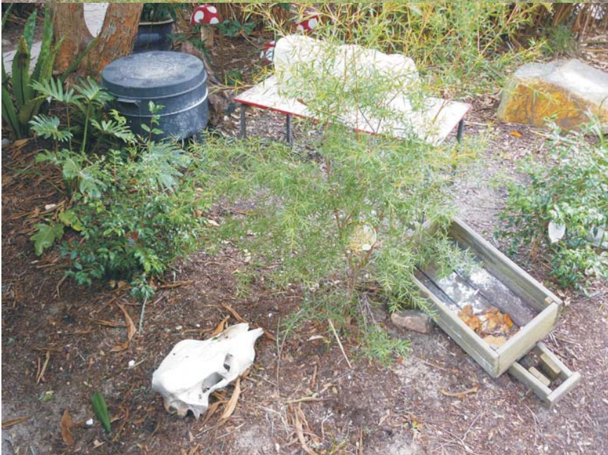
Skulls and worm farms