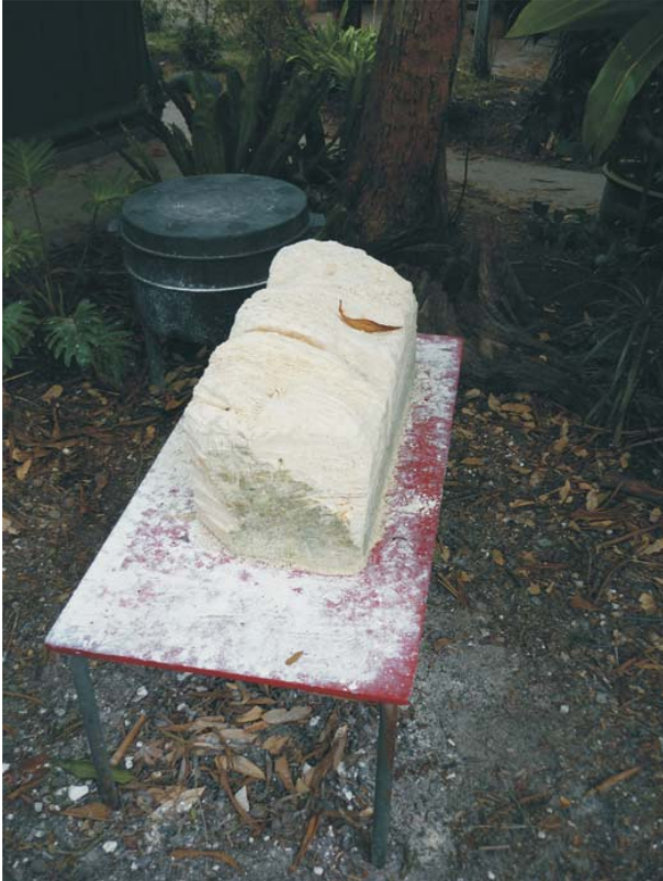
Soft stone to sculpt with. The children used real chisels and hammers.