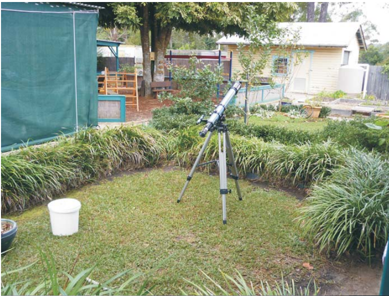
Looking for birds