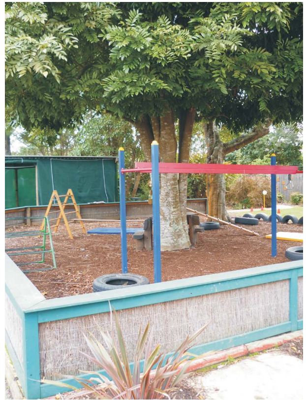
Small divided fencing